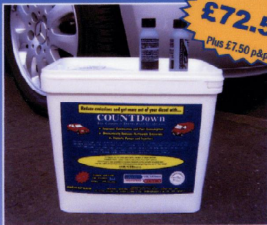
The COUNTDown 3 Pack for larger users (3 x 1 litre bottles, enough to treat 3000 litres)

COUNTDown is available to motorists in two easy to use packs