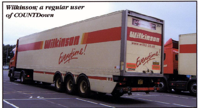
Wilkinson; a regular user of COUNTDown

It sounds too good to be true but, the makers Highspeed Lubricants Ltd, carried out exhaustive laboratory and field testing before launch and with impressive results. COUNTDown has been taken up by many in the commercial field including transport fleets, county councils and some "blue light" services and is now in use across the country with individual motorists. Typical is the response from the Wilkinson Group. This leading high street retailer is a regular COUNTDown user and takes its environmental responsibilities seriously especially when it comes to its transport fleet. With well over 100 lorries on the road servicing the home and garden retailers 200 plus stores in England and Wales, the company considers vehicle safety and pollution control vital so it uses COUNTDown to maintain low particulate emis-